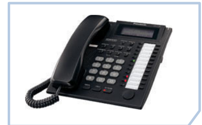
* Black models are available.

Navigator Key For quick adjustment of the volume and display contrast.